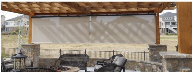
AwnTex® Outdoor Fabric

Made from vinyl-encapsulated polyester, AwnTex sun screen fabric is ideal for patio awnings, umbrella applications, window covers, and other shade structures . AwnTex provides excellent shading advantages without trapping heat or airflow. The unique material offers the translucent trait of mesh with the attractive design of shade cloth. The high-quality outdoor fabric is UV ray, mildew, and water resistant.