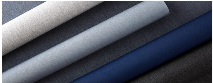
Sunbrella® Awning Fabric

Sunbrella awning fabric makes it easy to create beautiful shade structures that outperform the elements. This awning fabric offers excellent fade, weather, and water resistance. Choose from a wide selection of colors and patterns to fit any space. It is perfect for coordinating with Sunbrella upholstery fabrics . Sunbrella awning fabric comes in multiple widths, including an 80-inch option .